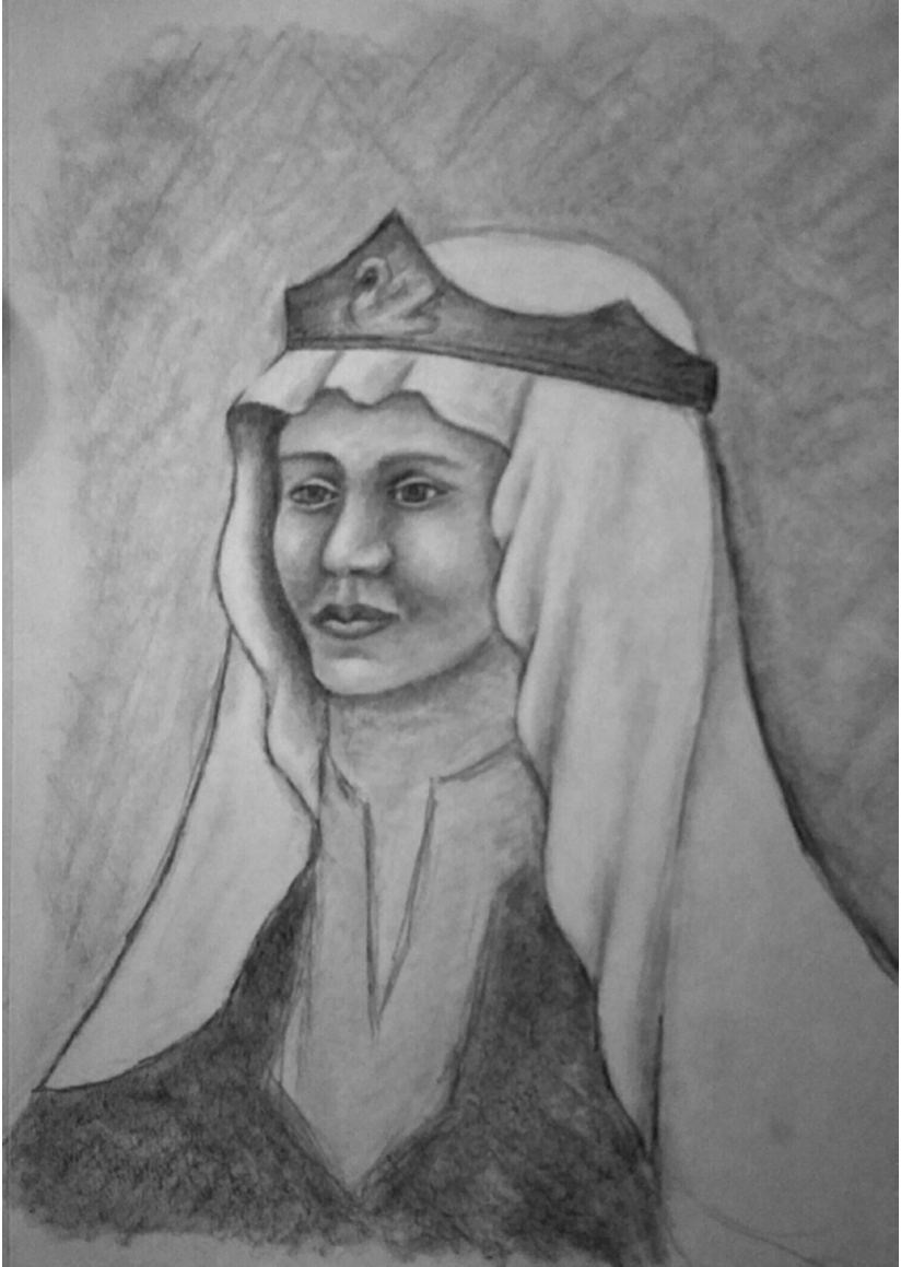
Princess Drawing by Yasamin al-Dimashqiyyah