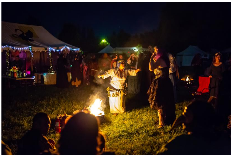
Previous 3 photos by Rob O'Connell